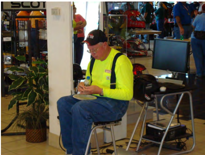
Me thinks this chair's backwards