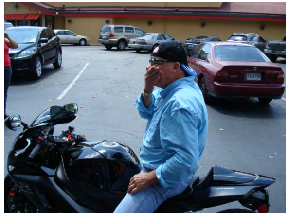
Who's this old goat on a sport bike????