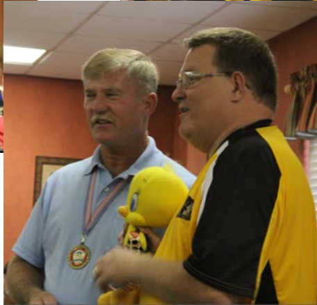
Scenes from the August meeting