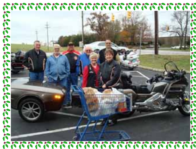
HARVEST OF HOPE FOOD DELIVERY 11-23-2009